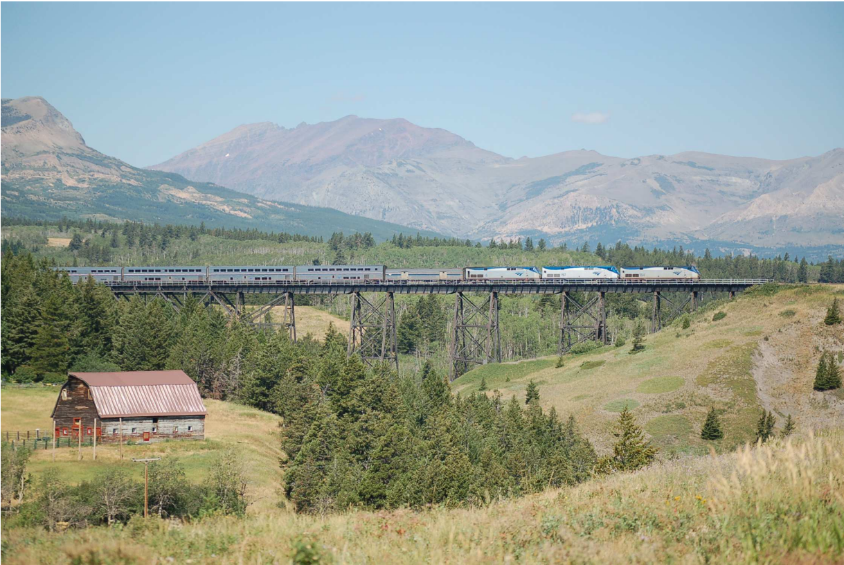
East of Glacier National Park, the eastbound Empire Builder is crossing Two Medicine trestle. July 26, 2007.