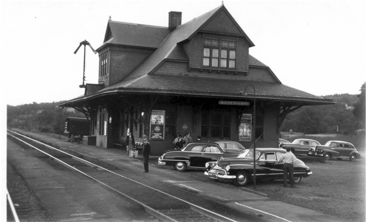
Mount Pocono, PA is viewed on September 4, 1950.