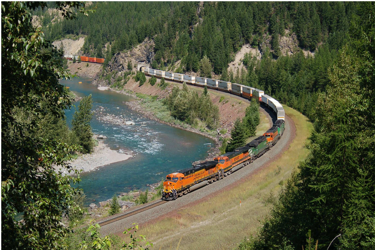
Not only is the scenery magnificent, but railfans are treated to a parade of trains on the BNSF mainline. This overlook is near Belton (West Glacier), Montana. July 26, 2007.