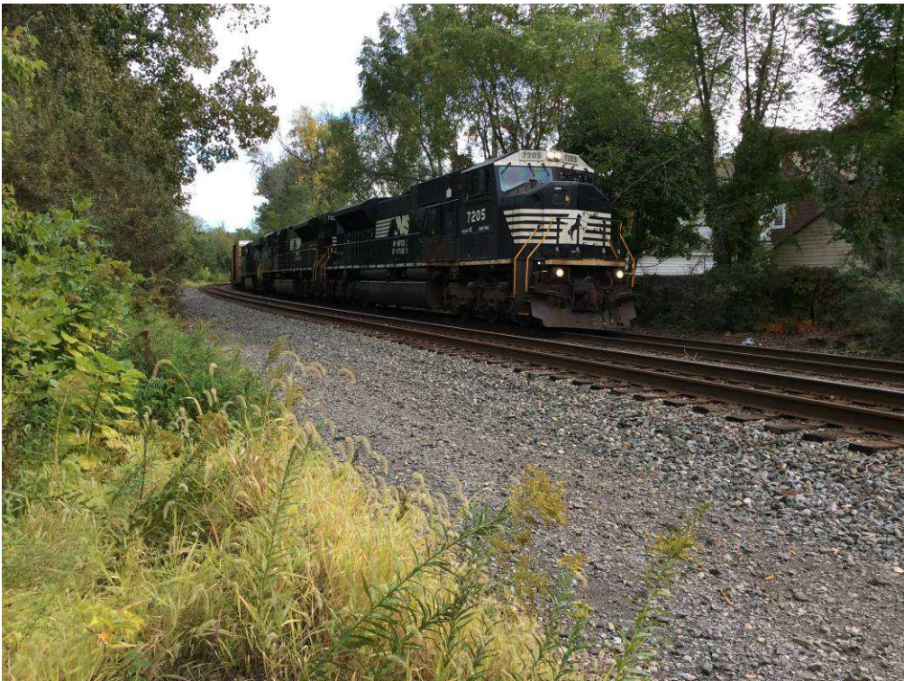
Norfolk Southern’s afternoon transfer to Ft. Erie is heading west to the International Bridge. This scene is near the Parkside Ave. viaduct. These NS transfers usually run left handed on the Belt line. October 5, 2018.