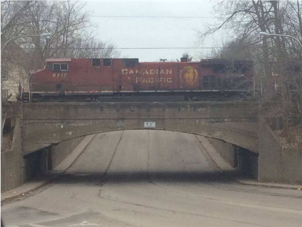
A somewhat grungy Canadian Pacific train heads east, March 18, 2020.

“SCENE” ON THE LINE - some scenes near Buffalo’s Parkside Avenue overpass on the Belt line