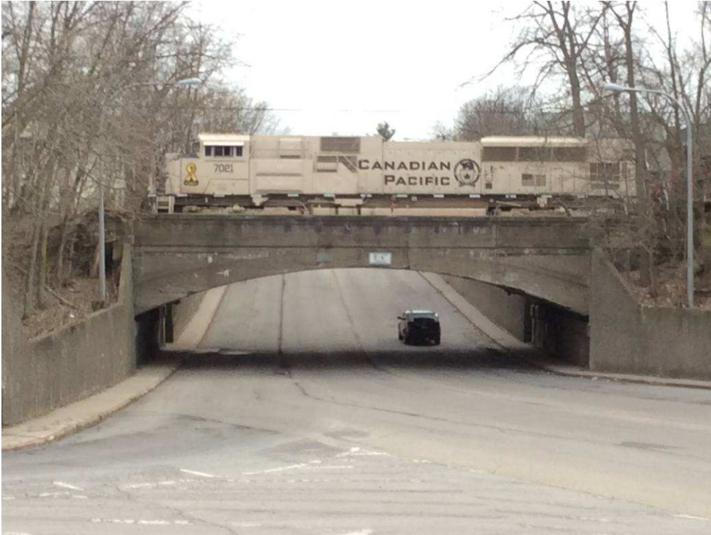
A “rare” sighting: CP Military Heritage unit heading to Frontier Yard, April 15, 2020.