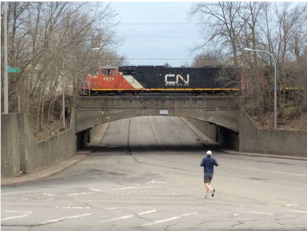
Daily Canadian National transfer is framed on the viaduct - heading to either Frontier or Babcock Street. April 7, 2020.