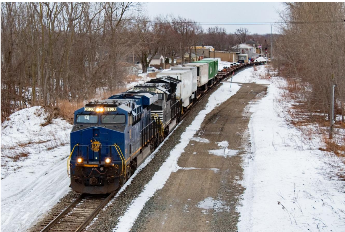
NS 28B at “GB” (Blasdell) w/ N&W 8103, 11/11/25