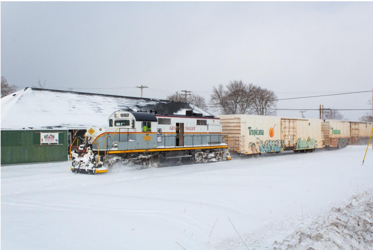
The Falls Road 2/17/25.