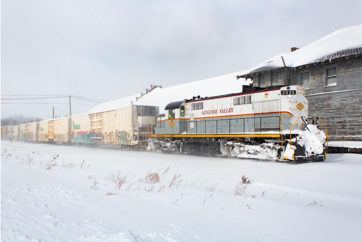
The Falls Road 2/17/25.