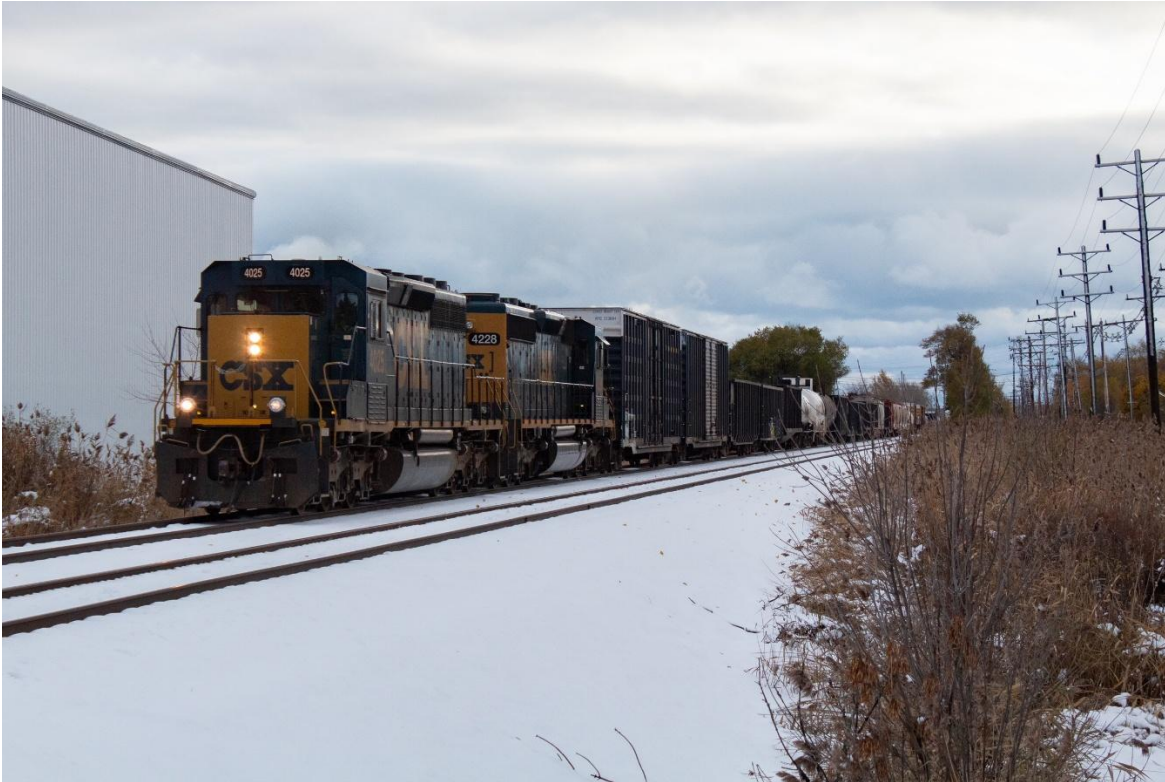
CSX L032 at Ensminger Rd, Tonawanda 11/11/25

Winter is never far away in WNY as we all know with another December upon us. But it provides a different and often special backdrop for the drama on the tracks we call “Railroading”.